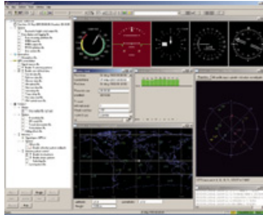
SimGEN for Windows® User Interface