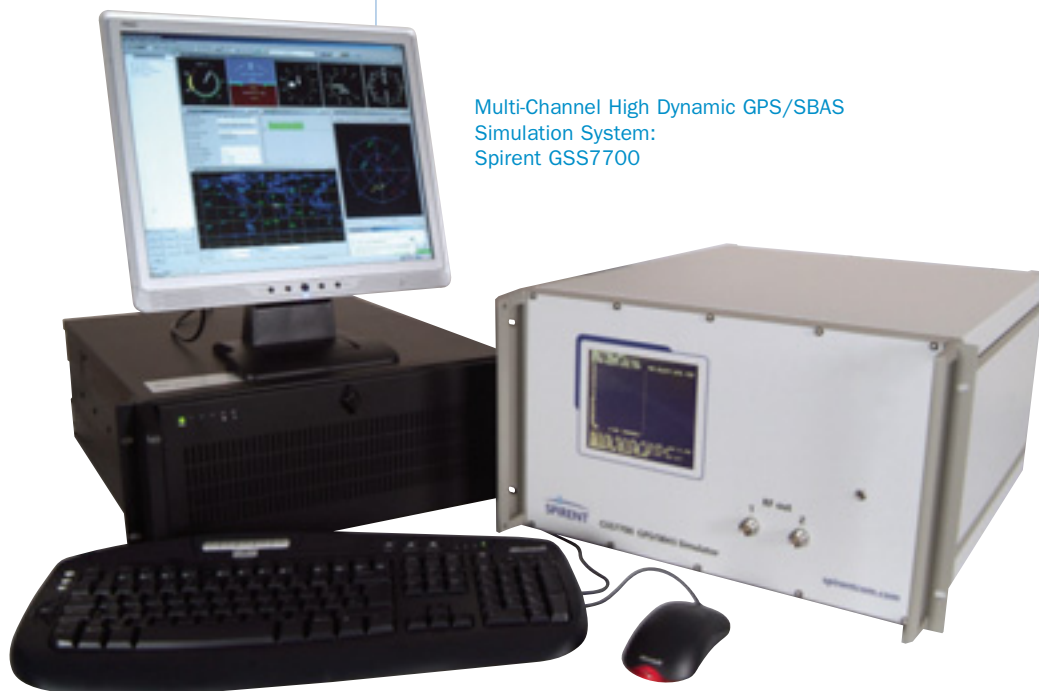
Multi-Channel High Dynamic GPS/SBAS Simulation System: Spirent GSS7700

SimGEN is also equipped as standard with the ability to capture, manipulate and present data from both the simulator itself and receivers equipped with NMEA-0183 output, and offers a hardware-in-the-loop capability with high update rates, over a number of interfaces such as IEEE-488 and Ethernet.